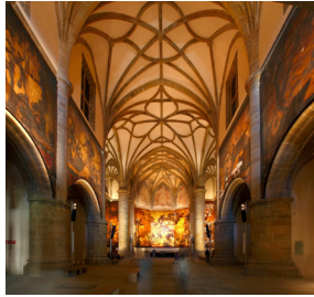
San Telmo Museum

The original San Telmo building, a Dominican convent built in the 16th century, is the result of a long process of successive modifications that have partially altered its physical and functional aspect. This is a unique specimen of Gipuzkoa architecture as it is a fusion of Gothic and Renaissance styles, creating a style that has been called "Elizabethan" architecture.